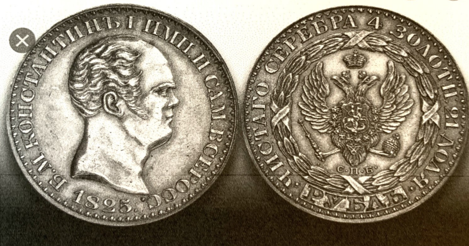
The 1825 Constantine Silver Ruble worth over seven million dollars-- only eight in the world (two at the Smithsonian)

After these two fortuitous events I was hooked on Russian coins. During each of my thirteen subsequent student trips to the Soviet Union and the Russian Federation, I always visited the Foreign Trade Bank ( VneshTorg Bank ) in Moscow, purchasing silver rubles with Czars Alexander III and Nicholas II on the face of the coin along with a commemorative marking the three hundredth anniversary of the Romanov dynasty. Sadly, I never advanced to Russian gold coins because of their prohibitive cost. And these days that seems impossible since gold on the world market has currently doubled to nearly two thousand dollars an ounce while silver, while also doubling, remains quite affordable at twenty eight dollars.